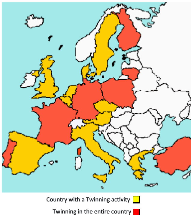
FIGURE 1 Twinning of the Allergy Diary in EIP on AHA Reference Sites (15-11-2016)

the geolocalized data that are never totally anonymous. The European Commission's Article 29 Working Party stated that geolocation information is personal data ( http://ec.europa.eu/newsroom/just/item-detail.cfm?item_id=50083 ) and that information can only be collected, shared, or stored with people's express consent. This is the case for MASK as users agree on geolocation in the terms of use of the app. Moreover, geolocation is optional and the user can allow it or not on his/her cell phone. Geolocation can be removed at any time. The problem of privacy due to geolocation was examined by the lawyers of each of the countries in which MASK has been launched and it was found to be in accordance with the existing laws. Moreover, geolocation is not used in the data mining process neither is the phone IP.